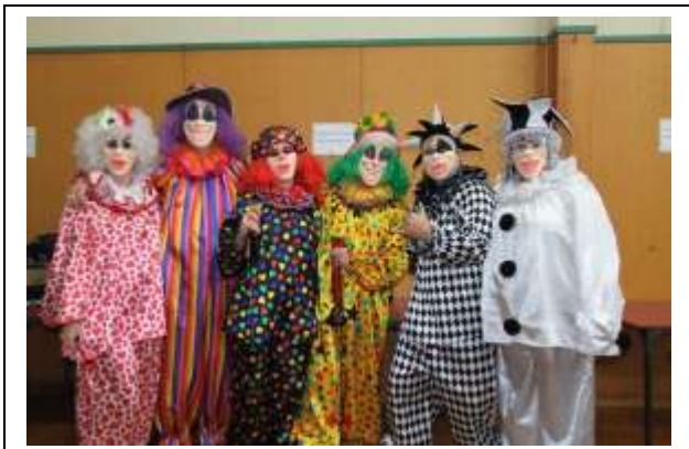
The Funny Farm